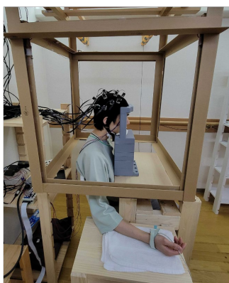
Figure 1. OPM-MEG recording.

Sync signals, stimulus onsets, the EOG, and the EMG were stored in the following channels.